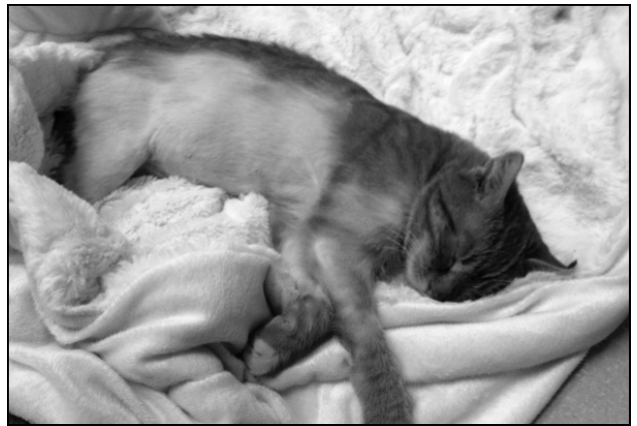
Sandwich enjoying the comfort of a blanket for the first time in her life

The "Bethel Six" came to MHAA from a horrific hoarding situation: no food, water or litter box. All they knew of life was fear, hunger, and a small filthy cage. Confined to cages four inches deep in feces, they existed stacked on top of each other and were deprived of food, water and human contact. Dogs barked and charged their cages all day long. These neglected and frightened kitties suffer muscle atrophy from cage confinement and struggle to trust humans. Flea infested and riddled with parasites, they are covered in urine burns and infected pressure sores. Wet food is a mystery to them, and they drink water as if they have never seen it before. MHAA is teaching them to walk, play and enjoy the comforts of a blanket and a heated space. Some cower in the back of their cage and some are grateful to finally know the warmth and comfort of a human touch. All are safe and ready to heal and begin their new lives.