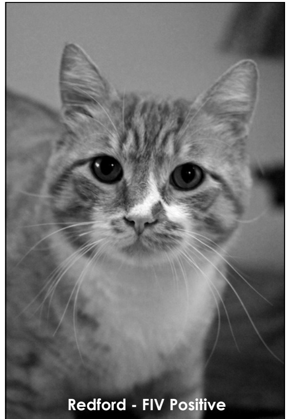
Redford - FIV Positive

MHAA would like to extend its appreciation to the following foundations that have provided support to our animals and shelter over this past year: PetSmart Charities; Petco Foundation; The William and Charlotte Parks Foundation; The BISS-SELL Pet Foundation; The Sandra Atlas Bass & Edythe & Sol G. Atlas Fund, Inc.; The Alexander Abraham Foundation; Gerald A. Doering Foundation; Community Foundation of Dutchess County - Cleopatra Fund; Geico Foundation and IBM Community Grants. We are tremendously pleased that these foundations share our concerns for homeless animal care and are helping us with their generous support. A very special thank you goes to the students of the S.A.D.D. Chapter of Beacon High School and Cablevision's Power to Learn program for selecting MHAA as their charity of choice for this past school year.