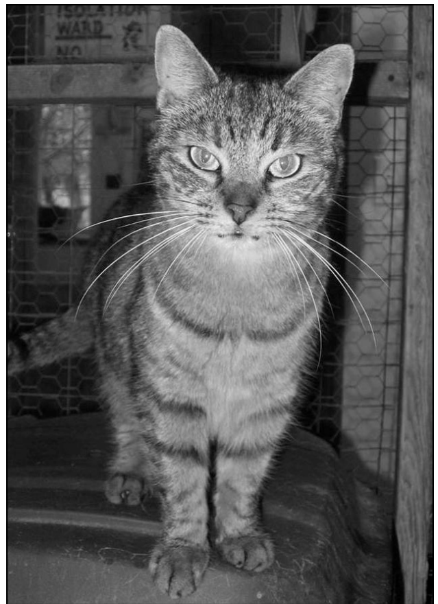
Cinnamon on her adoption day, over nine years ago.